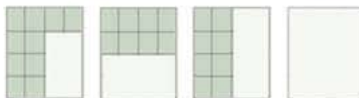
3/8 Page 2 5.1"x 9.25" 47.17 sq in Half Page 1 10.4"x 6.1" 63.44 sq in Half Page 2 5.1"x 12.5" 63.75 sq in Full Page 10.4"x 12.5" 130 sq in